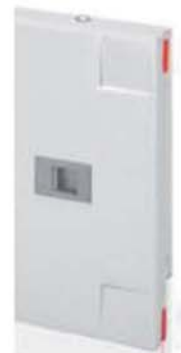
Anti insertion marking

We Purchase Circuit Breaker from ABB Bangladesh Ltd. and Manufacture DB or SDB