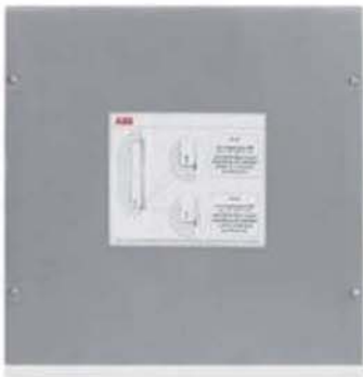
Cement spill protector